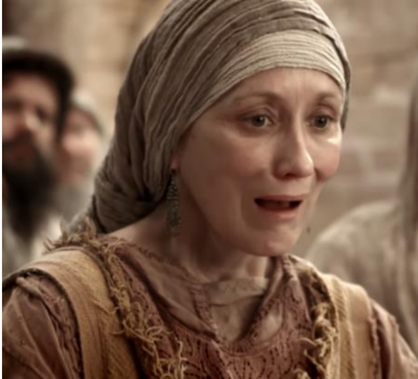
The Widow of Nain