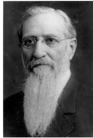
FIG. 2. Joseph F. Smith.

The vision that became D&C 138 was received on October 3, 1918, the day before the Church’s general conference. President Smith (fig. 2) had been in poor health for