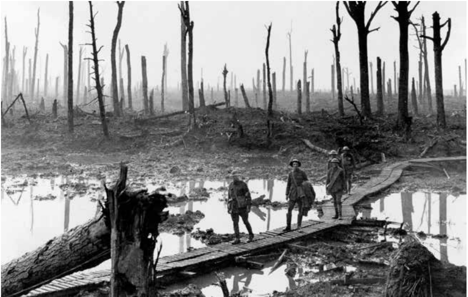
FIG. 1. The Great War (1914–1918) was one of the deadliest wars in history. The destruction and mounting casualties caused millions to mourn the loss of loved ones. Joseph F. Smith received a singular vision during this time. Chateau Wood, Ypres, 1917, photograph by Frank Hurley.