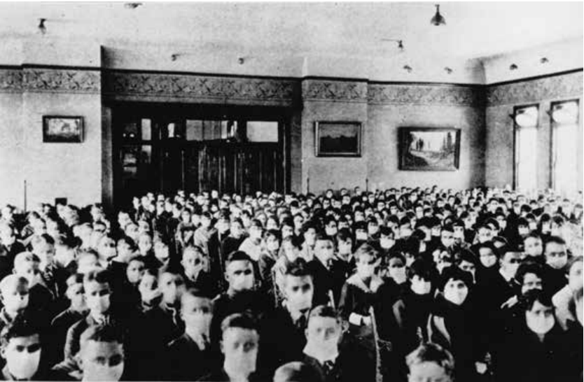
FIG. 10. The 1918–1919 influenza pandemic caused BYU to close in October 1918; when classes resumed in January 1919, students still wore masks.