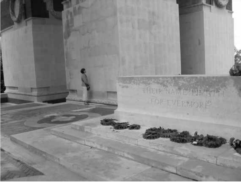
FIG. 7. Piers with inscribed names and the altar-like Great War Stone, Thiepval Memorial to the Missing of the Somme, Northern France.

Ecclesiasticus (or Sirach): “And some there be, which have no memorial; who are perished, as though they had never been” (verse 9); 35 or again in the most important British memorial of all: the Cenotaph, or empty tomb, in Whitehall, which has been the focal point of mourning and remembrance since it was first erected. Here the dead are honored by silence, itself an absence. When the Unknown Warrior was brought with great ceremony to be buried in Westminster Abbey in November 1920, over one million mourners flooded past the Cenotaph and the warrior’s tomb (fig. 8).