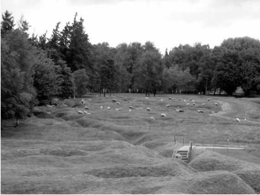
FIG. 6. Preserved battlefield and trenches from the Battle of the Somme in the Newfoundland Memorial Park, Beaumont-Hamel, Northern France.

The pervasiveness and ubiquity of death were overwhelming. Isaac Rosenberg describes the Front as “Dead Man’s Dump,” with “wheels lurch[ing] over the sprawled dead.” 26 Wilfred Owen writes to his mother of “the distortion of the dead” and of their “unburiable bodies.” 27 No Man’s Land, the space between the opposing trenches, was dotted with