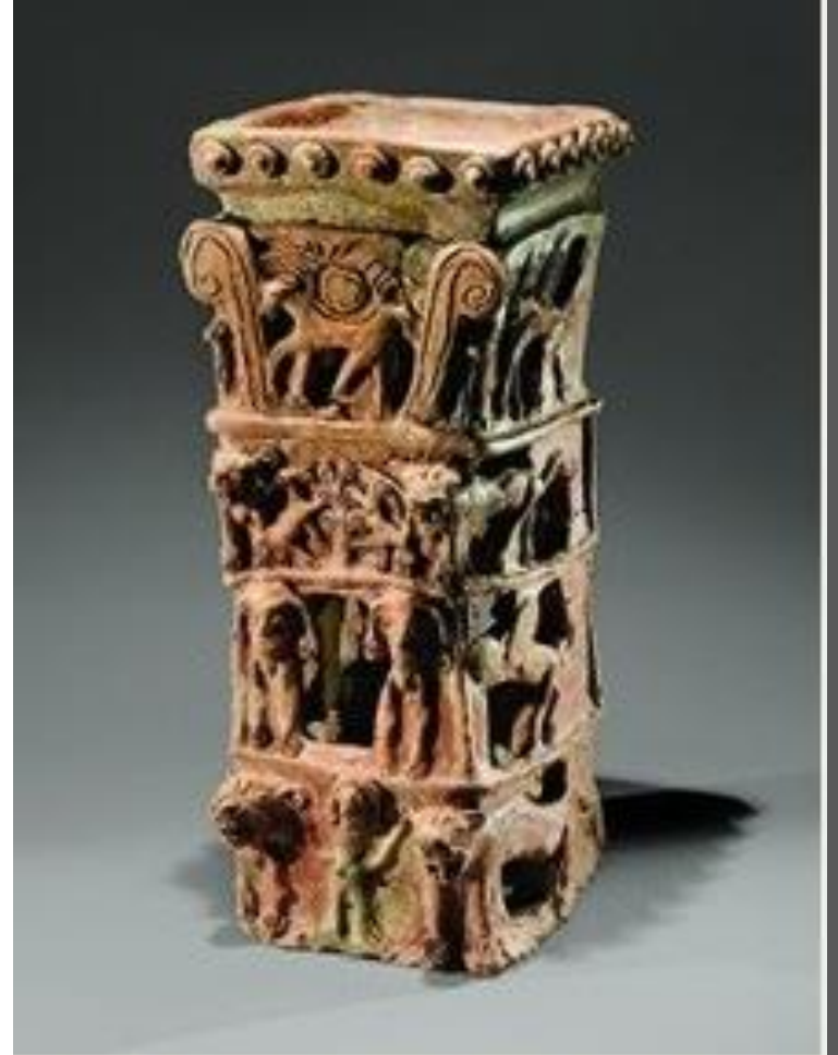
This four-tiered cult stand found at Tanaach is thought to represent Yahweh and Asherah, with each deity being depicted on alternating tiers. Note that on tier two, which is dedicated to Asherah, is the image of a living tree, often thought to be how the asherim as a cult symbol was expressed.

Peterson, Daniel C. (2000) "Nephi and His Asherah," Journal of Book of Mormon Studies : Vol. 9 : No. 2 , Article 4.