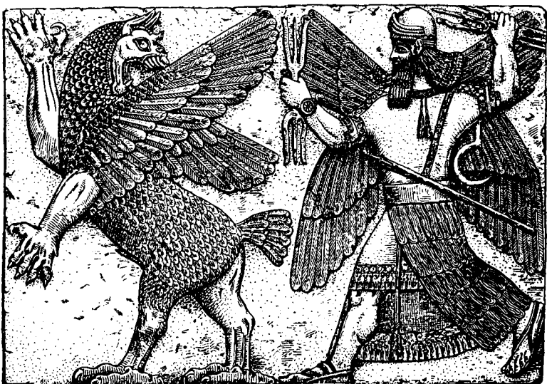
Figure 23. This bas-relief is believed to represent Marduk holding three-pronged thunderbolts in each hand, fighting the chaos monster, Tiamat.

It has been suggested that the creation account of Genesis 1:1–2:4 was used in the temple liturgy of Israel at the New Year's Festival before the Babylonian exile, when the enthronement of the Lord was celebrated, and possibly on other occasions as well. 12 The didactic-liturgical nature of the creation account itself, with its constant refrains, "and God saw that it was good," 13 "and the evening and the morning were the first day," 14 etc., strengthens the case for its ritual use. 15 Although this hypothesis is attractive, in the absence of "order of service" manuals (such as those found in Mesopotamia) or of descriptions of the Israelite rituals from external sources (such as Herodotus's description of the Persian sacrifices), it must remain tentative. 16