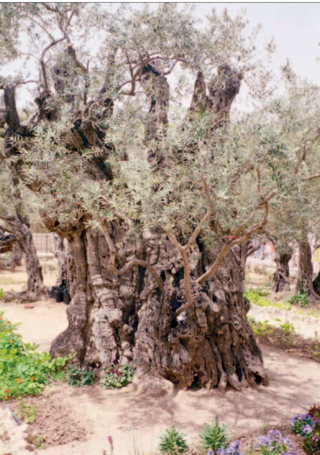
In the Book of Mormon's figurative language of the olive tree, we are taught that a "branch" from the original ethnic tree representing Israel in Palestine would be carried to the American promised land, where it would be "grafted" onto an indigenous root or people.