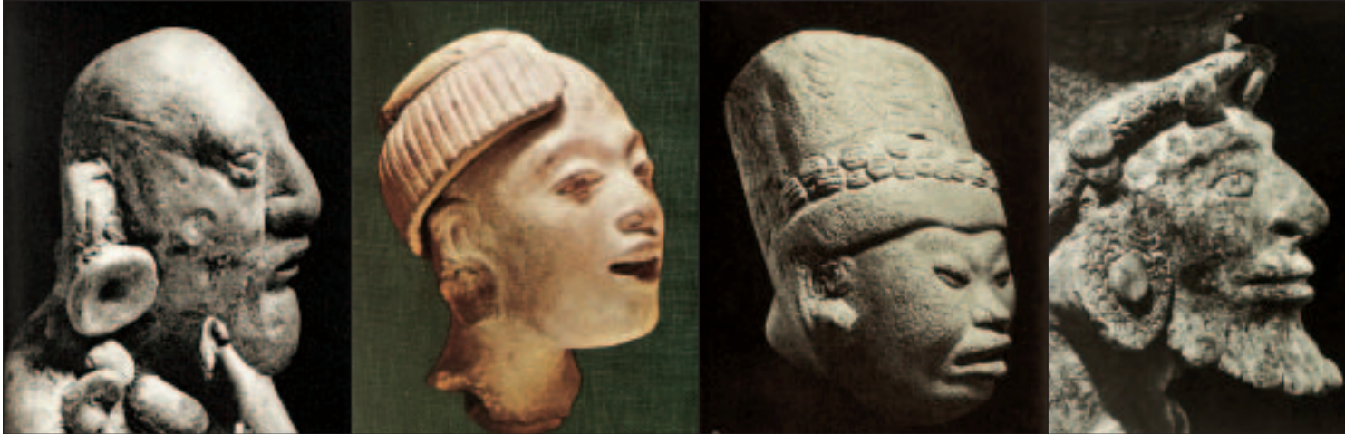
Portraits by ancient American sculptors display sharp ethnic differences in Mesoamerican peoples that DNA analysis so far has failed to identify.